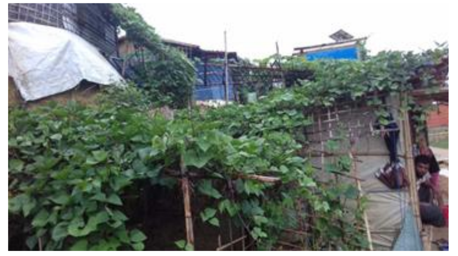
Receiving Seeds Rohingya People are Cultivating Vegetables on the Roof & Side of houses

Althogh the Coronavirus disease (COVID-19) issue hampered the normal movement & plan wise activities implementation, we have completed all activities in due time. Refugees are living a healthy life in Camp No.4. They are grateful to BASD and the Donor.