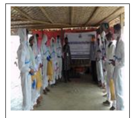
Distributon of Safety Dress (PPE)