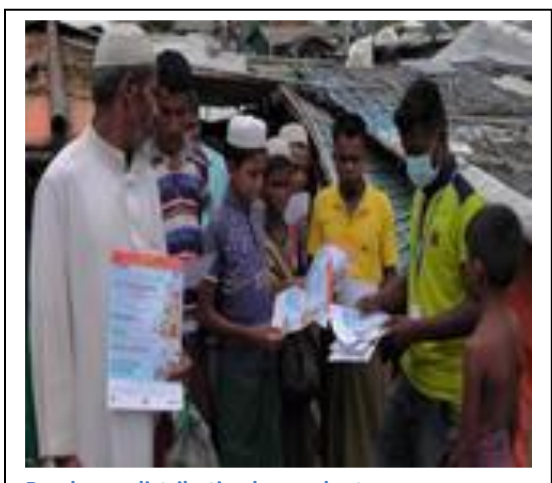
Brochures distributing by a volunteer