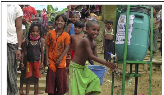
Washing system installed